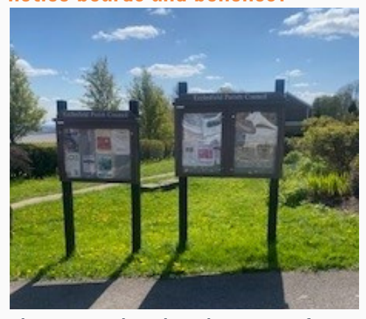
Above: Notice boards at the junction of Main Street and Norfolk Hill,Grenoside

Last year we have improved some of our notice boards and benches and provided some new ones.