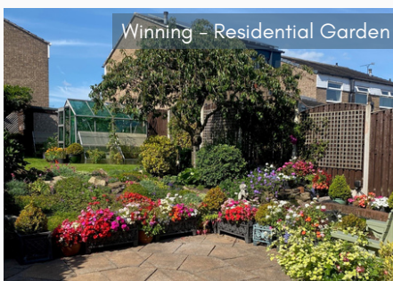
Winning - Residential Garden

This year's Garden competition winners were announced at the September Full Council meeting. Thank you to everyone who entered - your gardens were beautiful and, more importantly, ecologically diverse! To see a full list of winners please visit our website.