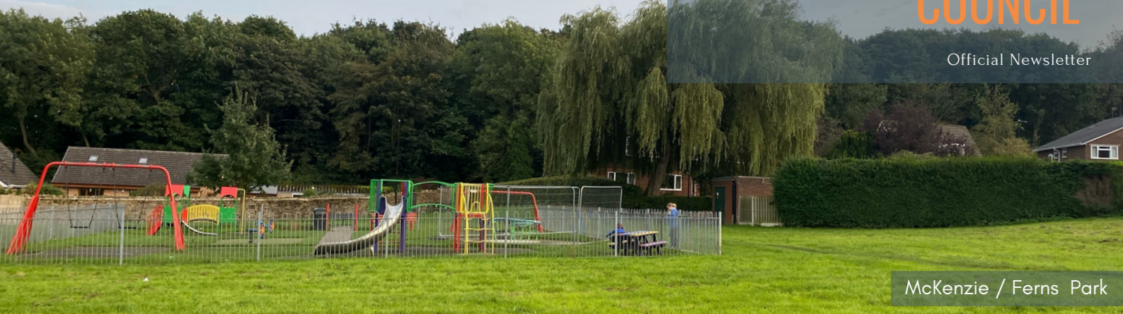
McKenzie / Ferns Park