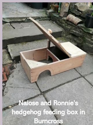
Naiose and Ronnie's hedgehog feeding box in Burncross