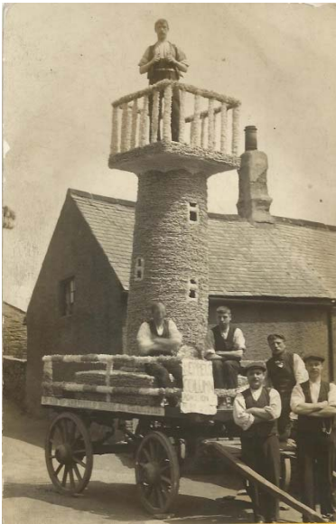
Hospital Parade float