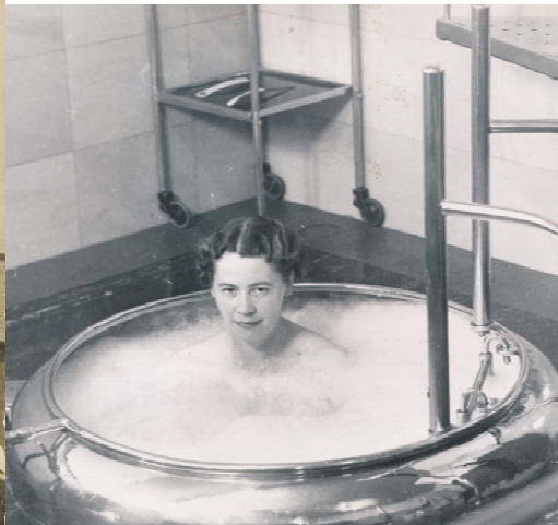
Aeratone Physiotherapy Bath, Newton Chambers collection.