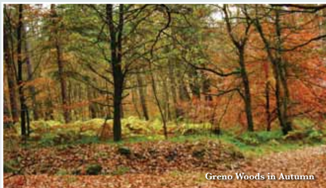
Greno Woods in Autumn

The woods are now owned by Sheffield Wildlife Trust but the woodland has been managed since at least medieval times. Timber was used for building and the underwood for making charcoal, clog soles, brushes and baskets. From 1950 the Forestry Commission managed the woods for conifer production and planted large areas of larch and Scots pine. Some remain, interspersed by sweet chestnut, beech and oak. Grenoside and District Local History group have produced two historical walks leaflets, one featuring Grenoside village and the other exploring Wheata Wood. For more information see www.grenosidelocalhistory.co.uk .