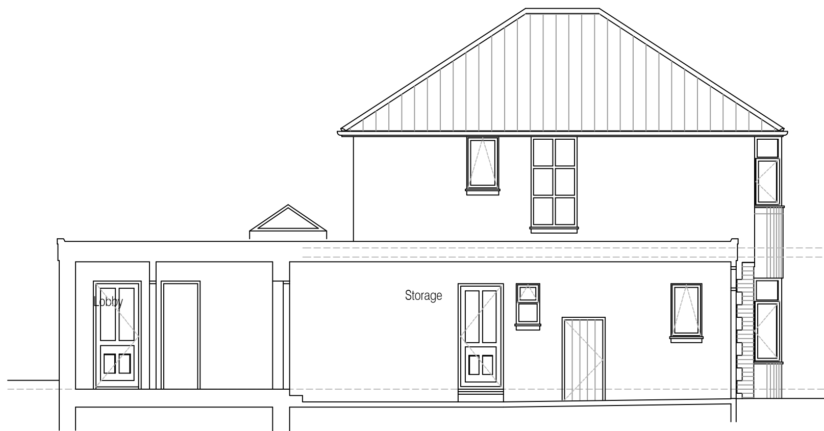
Proposed Side Elevation / Typical Section