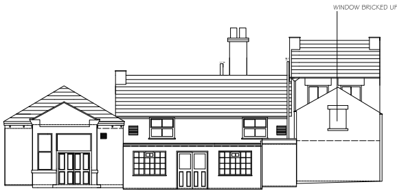
EASTERN FACING ELEVATION