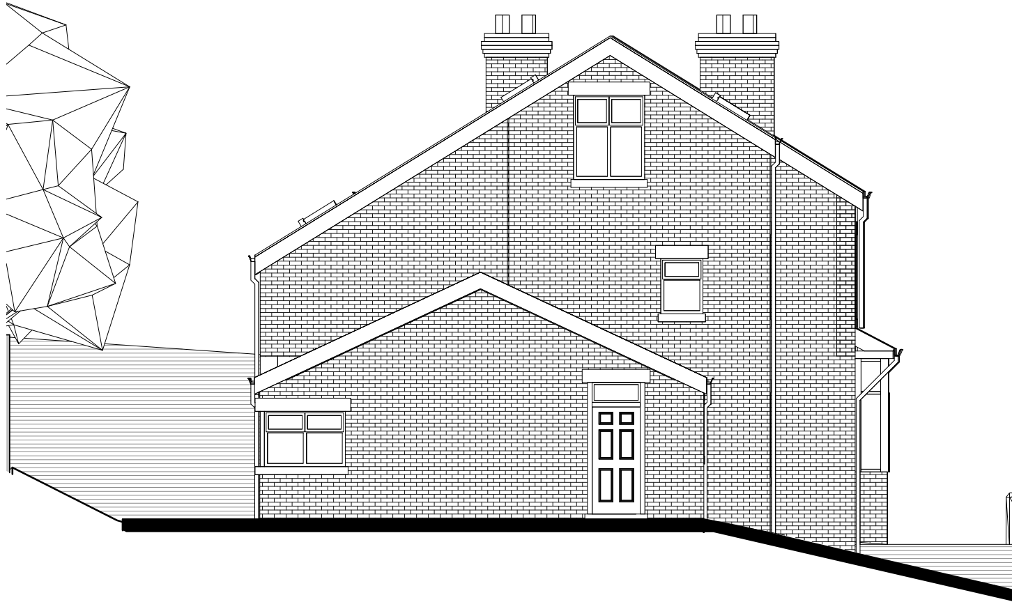
2 Side Elevation 1 : 100